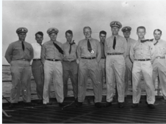
Walter Munk, fourth from the left

The combined resources of our University have proven a formidable resource in times of national needs. I welcome this opportunity to participate in the effort towards protecting our planet, before we are faced with a climatological Pearl Harbor.